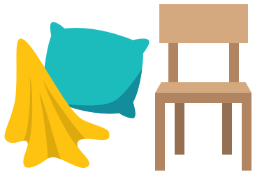
Cushions, sheets and chairs (indoor den)