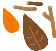
Leaves and twigs

Autumn walks are the best! Wrap up warm and go out to explore the glorious autumnal colours. As you walk, collect different sizes of leaves, twigs and nuts. When you get home play with collaging different shapes and colours to make animals, insects and faces. We used orange and brown autumn leaves to make a fox.